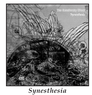
The Kandinsky Effect (Cuneiform)

For more information, visit aumfidelity.com. This group is at Ibeam Brooklyn Jun. 14th. See Calendar.